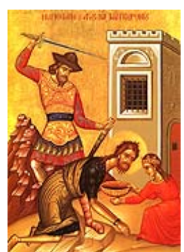
Beheading of St. John August 29