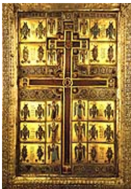
Procession of the Cross August 01