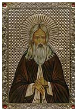
St. Herman of Alaska August 09