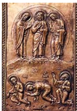
Transfiguration of The Cross August 06