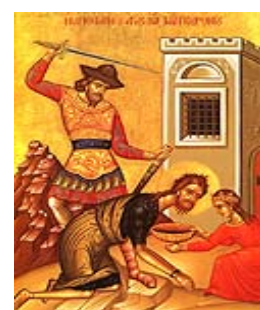
The Beheading of the Holy Glorious Prophet John the Baptist August 29