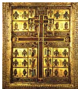
Procession of the Honorable Life-Giving Cross of The Lord August 01