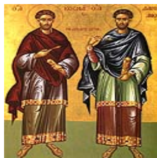
Holy Wonderworking Physicians Cosmos and Damian at Rome July 01