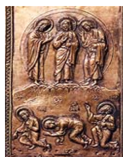
The Holy Transfiguration of Our Lord and Savior August 06