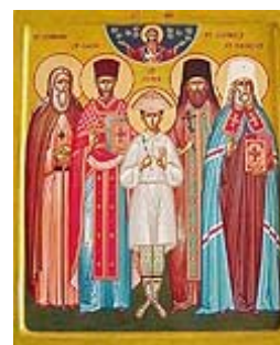
New Martyrs of Alaska, Hieromonk Juvenaly & Peter the Aleut