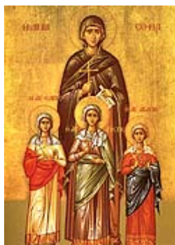
Martyr Sophia and Her Daughters Faith, Hope and Love