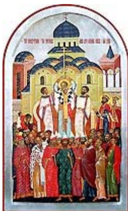
Exaltation of the Holy Cross

The Nativity of Our Most Holy Lady Theotokos and Ever Virgin Mary is celebrated by the Church as a day of universal joy. Within the context of the Old and the New Testaments, the Most Blessed Virgin Mary was born on this radiant day, having been chosen before the ages by Divine Providence to bring about the Mystery of the Incarnation of the Word of God. She is revealed as the Mother of the Savior of the World, Our Lord Jesus Christ.