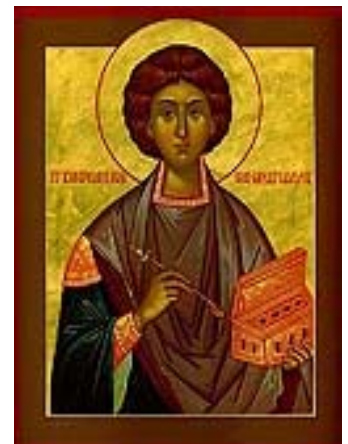
Greatmartyr and Healer Panteleimon July 27