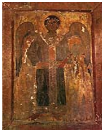
Synaxis of the Archangel Gabriel July 13