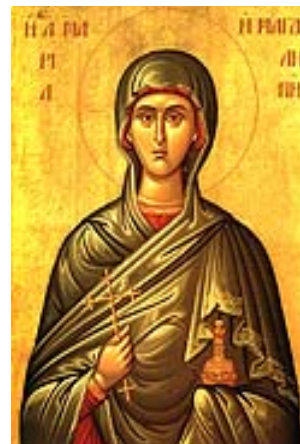
Myrrhbearer and Equal of the Apostles Mary Magdalene us July 22