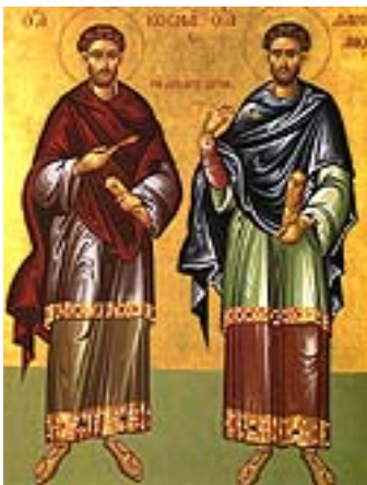
Holy Wonderworking Unmercenary Physicians Cosmas and Damian at Rome July 01

Finally, St. Christina was executed with a sword, after showing unwavering faith in our Lord Jesus Christ, enduring unspeakable suffering for His sake.