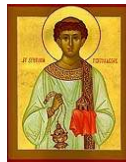
Protomartyr and Archdeacon Stephen December 27