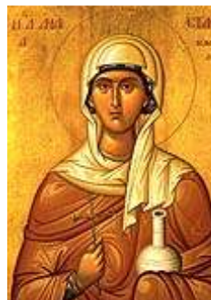
Greatmartyr Anastasia "Deliverer From Potions" December 22