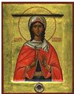
Greatmartyr Barbara At Heliopolis, in Syria December 4

Having reached old age, St Nicholas peacefully fell asleep in the Lord. His venerable relics were preserved incorrupt in the local cathedral church and flowed with curative myrrh, from which many received healing. In the year 1087, his relics were transferred to the Italian city of Bari, where they rest even now. The name of the great saint of God, the hierarch and wonderworker Nicholas, a speedy helper and suppliant for all hastening to him, is famed in every corner of the earth. There is, perhaps, not a single city without a church dedicated to him.