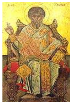
St. Spyridon the Wonderworker December 12