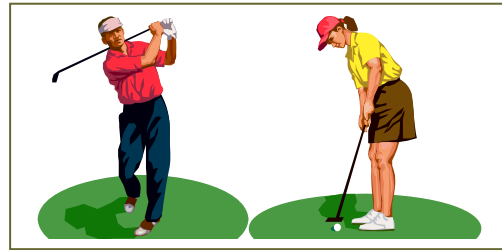
A Great Time was had by all.

The Golf Outing is of course a very important fund raiser for our Church which takes a lot of effort and hopefully next year we will have a new crew in making sure this is a success again. Besides the arrangements for the golf game itself, we have Tee