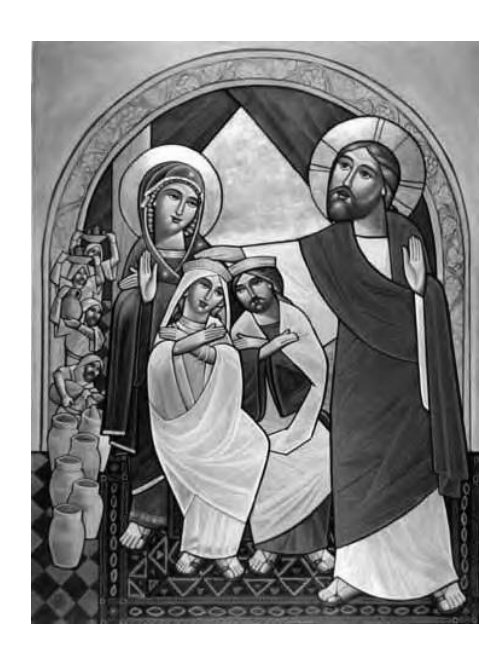
As a bridegroom He has set a crown on me, and as a bride adorns herself with jewels so He adorns me.