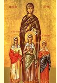
Martyr Sophia and her Daughters Sept 17