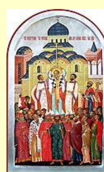
Exaltation of the Cross Sept 14