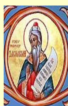
Prophet Zachariah Sept 05