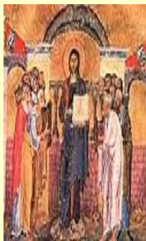
Church New Year Sept 01