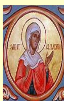
Righteous Elizabeth Sept 05