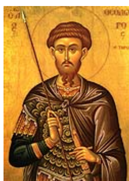
St. Theodore – 1st Saturday of Great Lent March 12