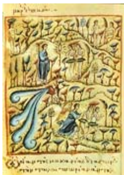
Cheesefare Sunday (Forgiveness Sunday) March 06