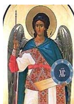
Synaxis of the Archangel Gabriel March 26