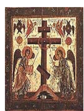
Veneration of the Cross March 27