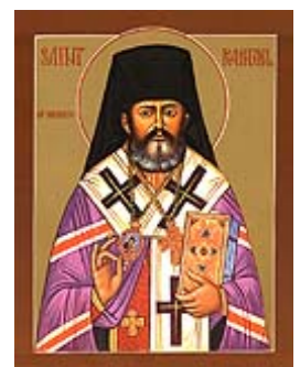
Saint Raphael of Brooklyn February 27