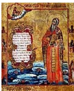
Hieromartyr Charalampus (St. Haralambos) February 10