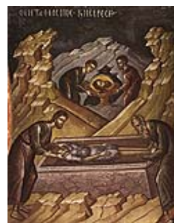
Finding of the Head of John the Baptist February 24