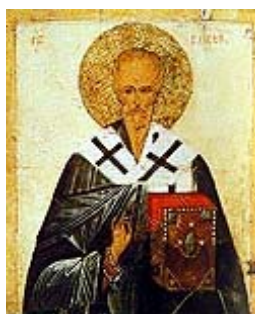
Hieromartyr Blaise February 11