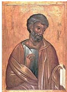
The Holy Glorious Leader of the Apostles, Peter