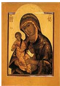
Icon of The Mother of God, "It Is Truly Meet"