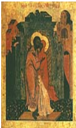
Conception of The Theotokos December 09