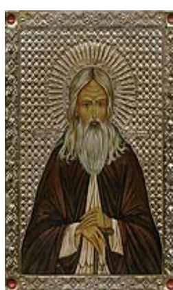
The Venerable St. Herman of Alaska December 13