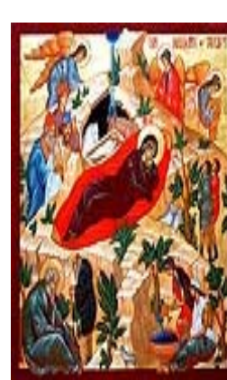
Nativity of Our Lord and Savior Jesus Christ December 25