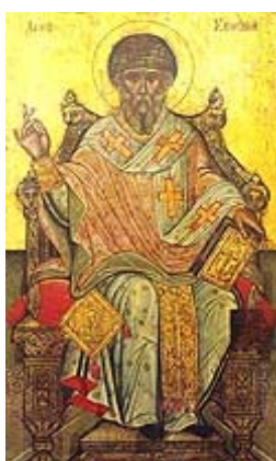
Saint Spyridon The Wonderworker December 12