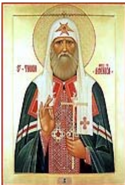
St. Tikhon, Enlightener Of North America April 7