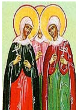
Martyrs Agape, Irene & Chionia April 16