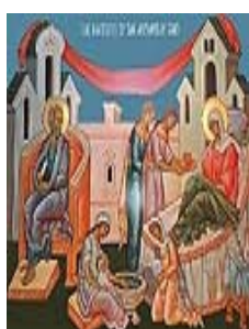
Nativity of our Holy Lady the Mother of God and Ever-Virgin Mary September 08