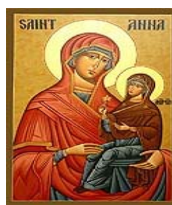
Holy, Righteous Ancestor of God, Anna September 09