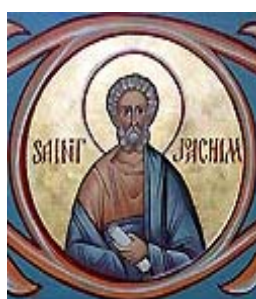
Most Holy, Righteous Ancestor of God, Joachim September 09