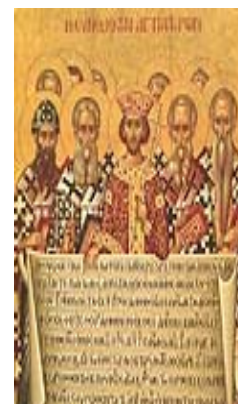
Commemoration of the Holy Fathers of the First Ecumenical Council