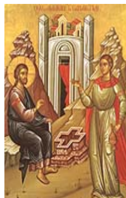
The Samaritan Woman