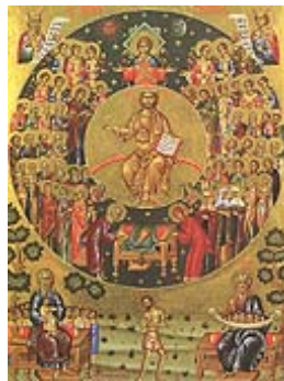
Synaxis of All Saints June 14