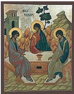
Day Of The Holy Spirit June 08

With the descent of the Holy Spirit upon Christ's disciples, the time of salvation, the Divine work of redemption has been completed, the fullness revealed, all gifts bestowed: it belongs to us now to "appropriate" these gifts, to be that which we have become in Christ: participants and citizens of His Kingdom. Every Sunday now will be called "after Pentecost" – and this means that it is from the power and light of these fifty days that we shall receive our own power, the Divine help in our daily struggle. At Pentecost we decorate our churches with flowers and green branches – for the Church "never grows old, but is always young." It is an evergreen, ever-living Tree of grace and life, of joy and comfort. For the Holy Spirit – "the Treasury of Blessings and Giver of Life – comes and abides in us, and cleanses us from all impurity," and fills our life with meaning, love, faith and hope.