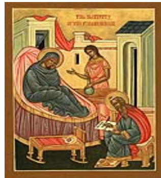
Nativity of the Holy Glorious Prophet, Forerunner and Baptist John June 24