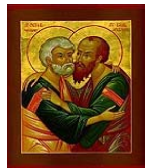
The Holy Glorious and All-Praised Leader of the Apostles, Peter & Paul June 29