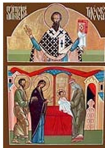
The Circumcision of our Lord and Savior Jesus Christ