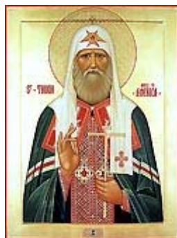
St Tikhon the Patriarch of Moscow, and Enlightener of North America April 07