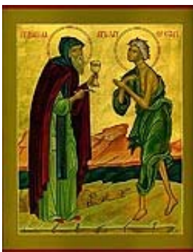
Venerable Mary of Egypt April 01