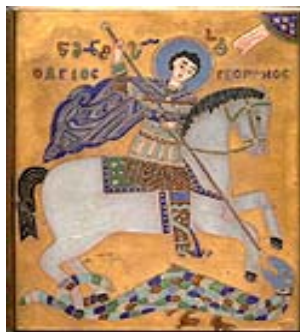
Greatmartyr, Victory-bearer and Wonder-worker George April 23