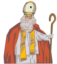
Symbols of Our Christmas Pageant